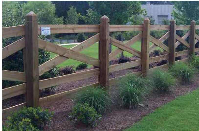
Cedar Crossback with Double Bottom Rail