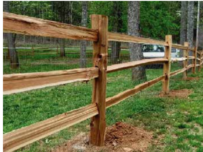
Rustic Cedar Split Rail