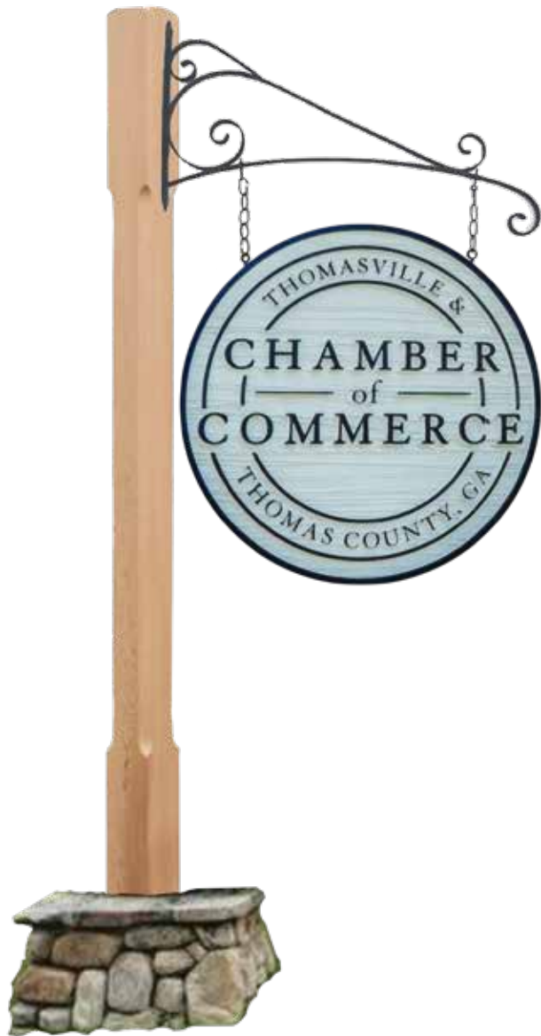
Italianate Sign Bracket Chamfered Cedar Post Large Stone Base Round Wooden Sign